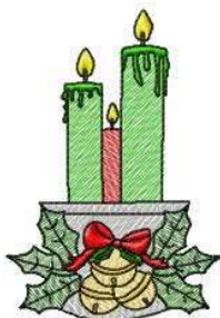
File: ChristmasCandle07.pes Stitches: 6752 Size: 2.70x3.91 " Size: 68.5x99.2 mm