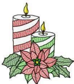
File: ChristmasCandle10.pes Stitches: 6289 Size: 3.46x3.91 " Size: 87.8x99.2 mm