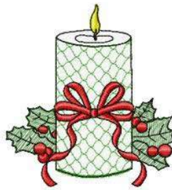
File: ChristmasCandle05.pes Stitches: 7541 Size: 3.65x3.91 " Size: 92.7x99.4 mm