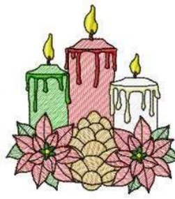
File: ChristmasCandle02.pes Stitches: 9701 Size: 3.60x3.90 " Size: 91.4x99.0 mm