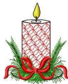
File: ChristmasCandle12.pes Stitches: 7645 Size: 3.08x3.90 " Size: 78.3x99.0 mm