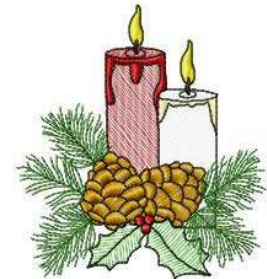
File: ChristmasCandle09.pes Stitches: 8739 Size: 3.56x3.90 " Size: 90.4x99.0 mm