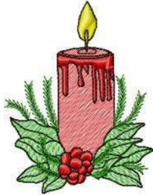
File: ChristmasCandle01.pes Stitches: 6203 Size: 3.03x3.90 " Size: 76.9x99.0 mm