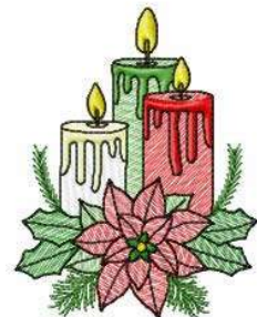
File: ChristmasCandle06.pes Stitches: 7743 Size: 3.04x3.90 " Size: 77.3x99.0 mm