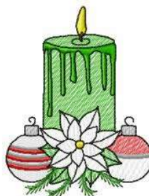
File: ChristmasCandle11.pes Stitches: 7529 Size: 2.98x3.91 " Size: 75.7x99.2 mm