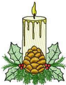
File: ChristmasCandle04.pes Stitches: 7272 Size: 3.07x3.91 " Size: 78.0x99.2 mm