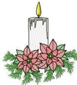
File: ChristmasCandle08.pes Stitches: 7196 Size: 3.57x3.90 " Size: 90.8x99.1 mm