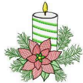
File: ChristmasCandle03.pes Stitches: 6724 Size: 3.78x3.90 " Size: 96.0x99.1 mm